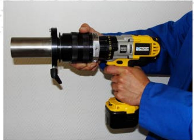
Very light weight, portable and versatile

The PROTEM SE65 clamps on the outer part of the tube through collets. Usually, one collet per diameter is necessary. No distortion of the tubes, even for the thinnest ones. Motorization: Electrically or cordless. The SE65 can be mounted onto a bench support. The ideal solution for applications within various fields such as: